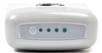
Battery status LED indicators with fuel gauge

With an aggressive scan engine, the CR2600 decodes bar codes faster and features patented technologies including dual field optics and glare reducing technology. The result is unequalled, unmatched bar code reading performance.